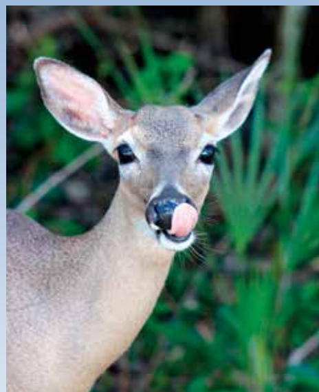
Virginia Bayne from Fort Myers High took first place in the 2020 contest with her photo "Lip Smacking Good."