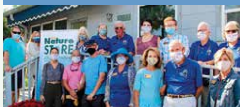
The Chamber of Commerce and "Ding" team celebrated the grand opening of Nature Store2 on November 20.