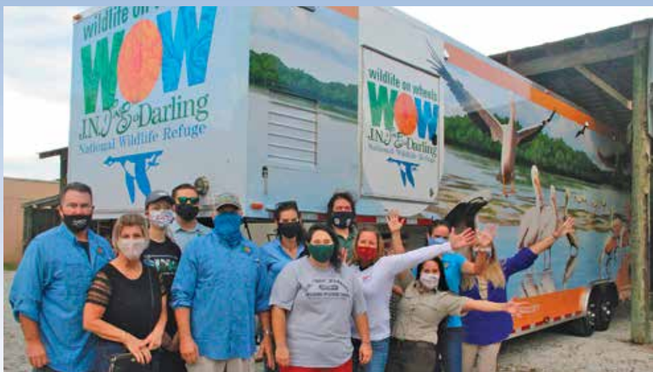
The WoW team celebrates the long-awaited arrival of the urban outreach classroom.