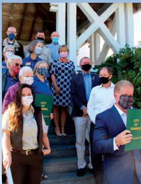
The city of Sanibel Council recognized the Refuge's 75th Anniversary with the reading of a proclamation on November 3.