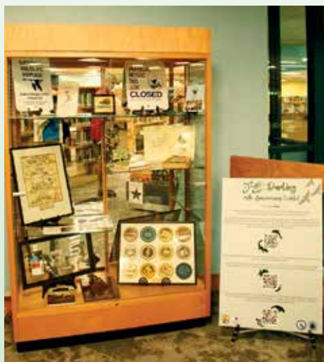
DDWS partnered with the Sanibel Public Library on exhibits about Jay Norwood "Ding" Darling.