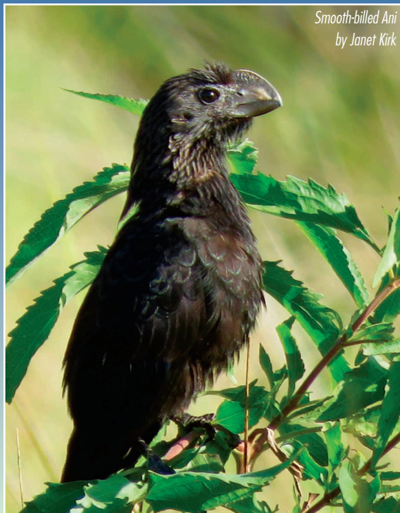
Smooth-billed Ani