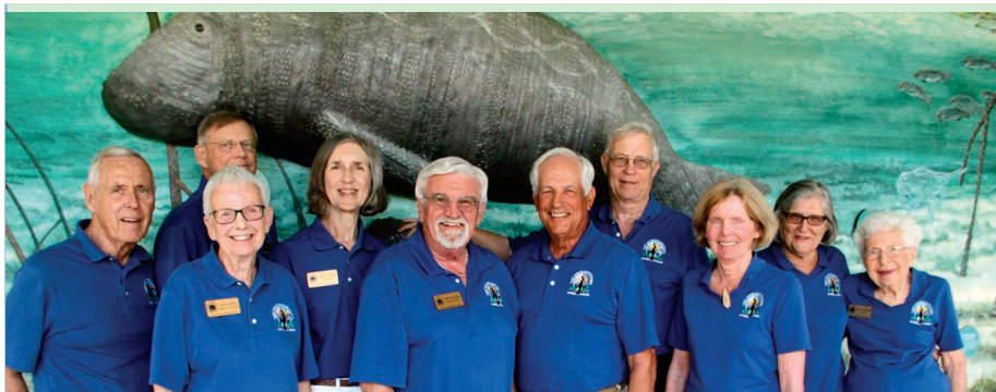
A gathering of your 2019 Board of Directors and Emeritus Board Members at our 2018 America's Best Restroom® following February's monthly meeting