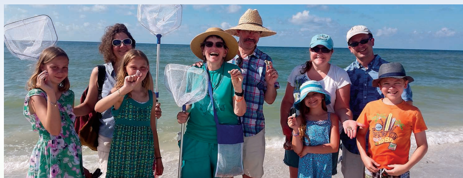
Family Beach Walk combines sand, water, and learning during both the winter and summer season programs.