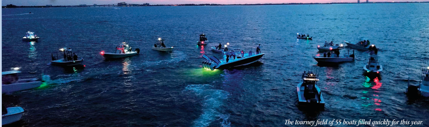
The tourney field of 55 boats filled quickly for this year.