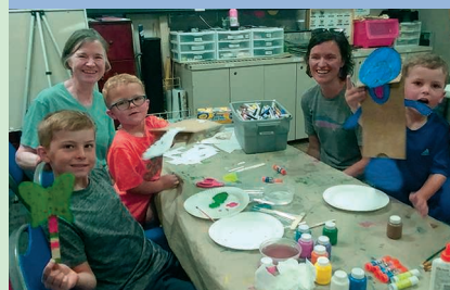
The Refuge celebrated National Wildlife Day on Friday, February 22, with nature crafts, an Indigo Trail bike, and other wildlife-related activities.