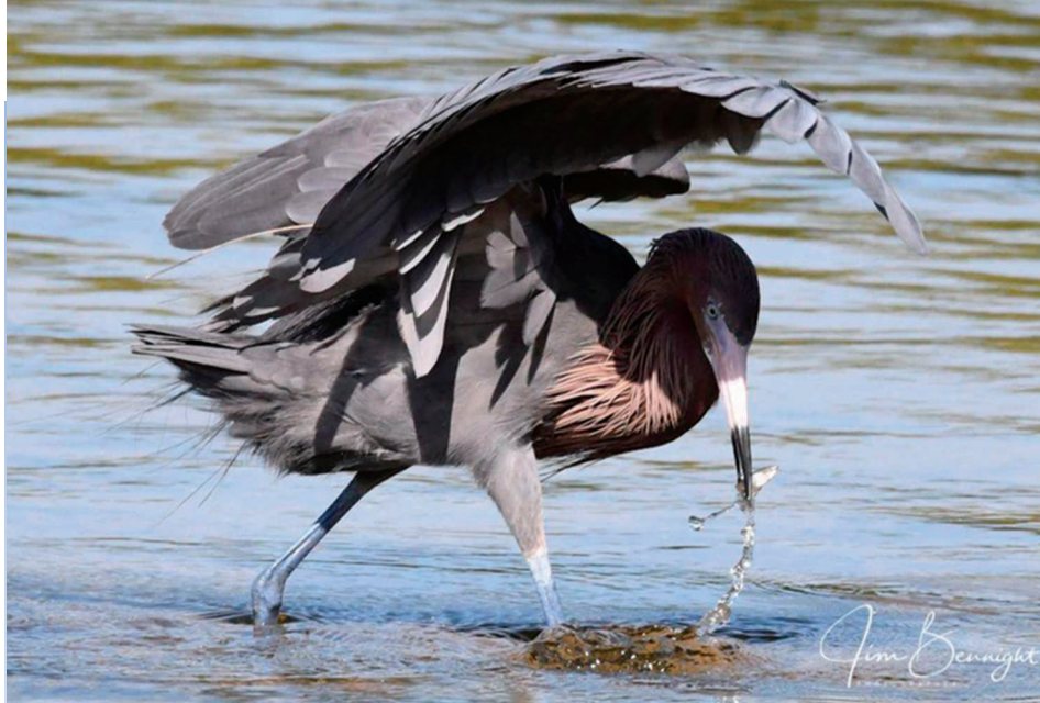
One of the Reddish Egrets tagged for ARCI's study.