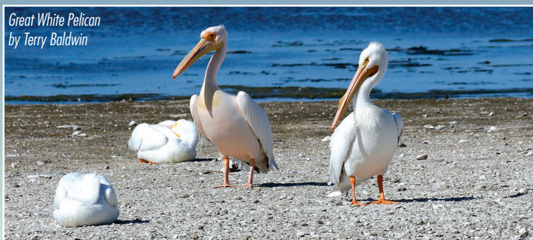
Great White Pelican