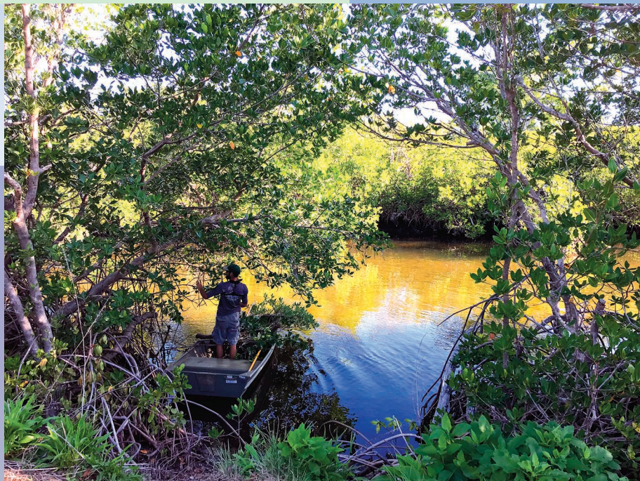
Crews are at work clearing wildlife-viewing "windows" along Wildlife Drive and Indigo Trail and at Bailey Tract, funded by DDWS to assist the Refuge maintenance crew with its backlog of work due to budget shortfalls.