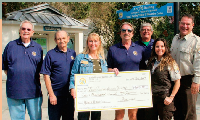
The Sanibel-Captiva Optimists Club presented the "Ding" Darling Wildlife Society with a check for $4,000, proceeds from its 2018 Sanibel Blues & Jazz Fest.