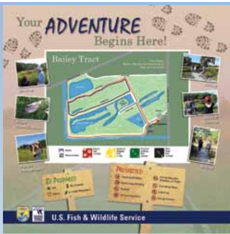
One of 12 new panels that will improve the Bailey Tract experience, this one welcomes visitors at the parking lot kiosk.