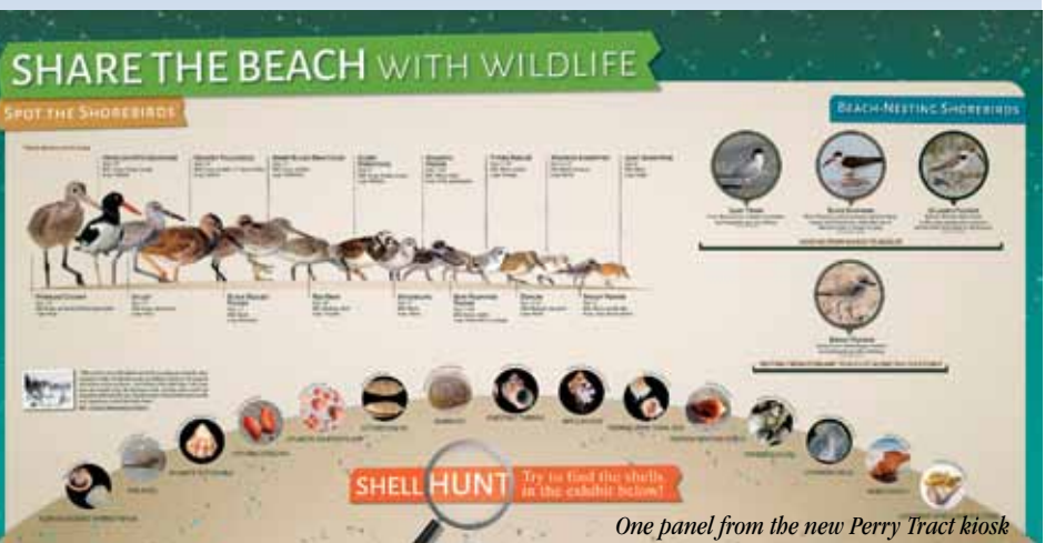
One panel from the new Perry Tract kiosk