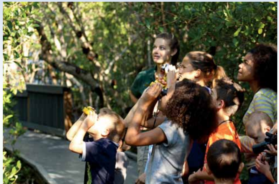
Education grants and donations help us keep the Refuge’s important programs going.