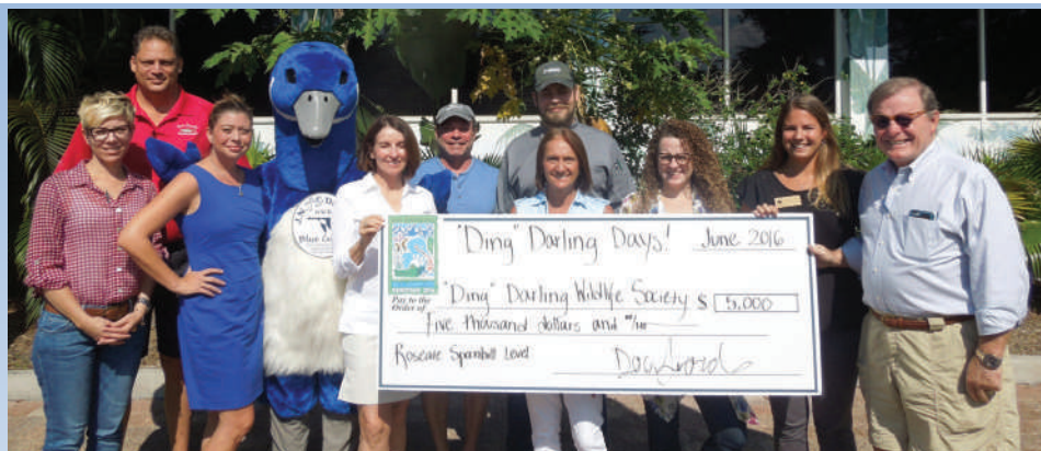
Roseate Spoonbill level sponsors Doc Ford's Sanibel Rum Bar & Grille

The U.S. Fish & Wildlife Service, "Ding" Darling Wildlife Society, and Tarpon Bay Explorers cosponsor "Ding" Darling Days with generous support from the local community and businesses. See this page for a list of our sponsors and a history of "Ding" Days.