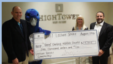
HighTower/Thomas & Swartz Wealth Management again sponsors this year's series.