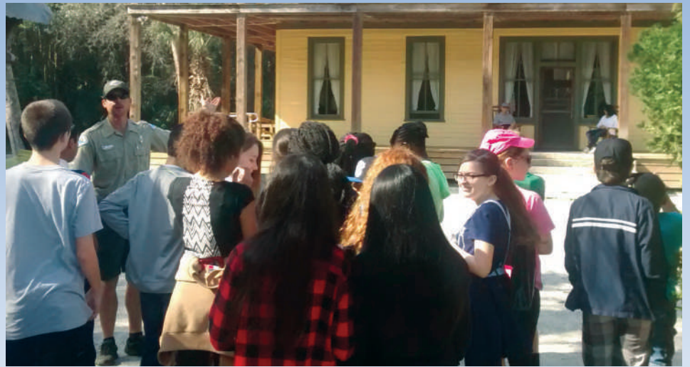
Lehigh Middle School students working on their 2015-2016 grant project “Life in a Dystopian Society.”