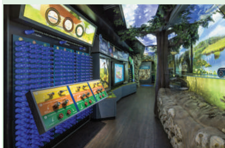
WaterVentures Florida's Learning Lab makes a one-day stop on December 3.