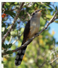
Mangrove cuckoos are among the species whose habitat the Wulfert Road property acquisition will benefit.