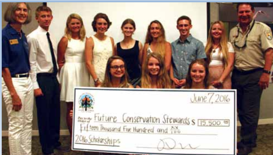
Scholarship winners 2016

Other named scholarships for 2016 include: