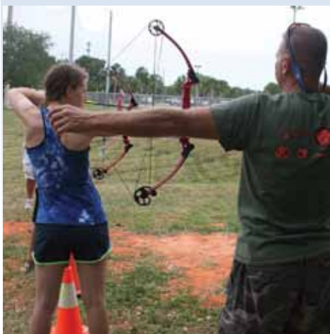
Archery lessons are once again on the agenda for Family Fun Day.