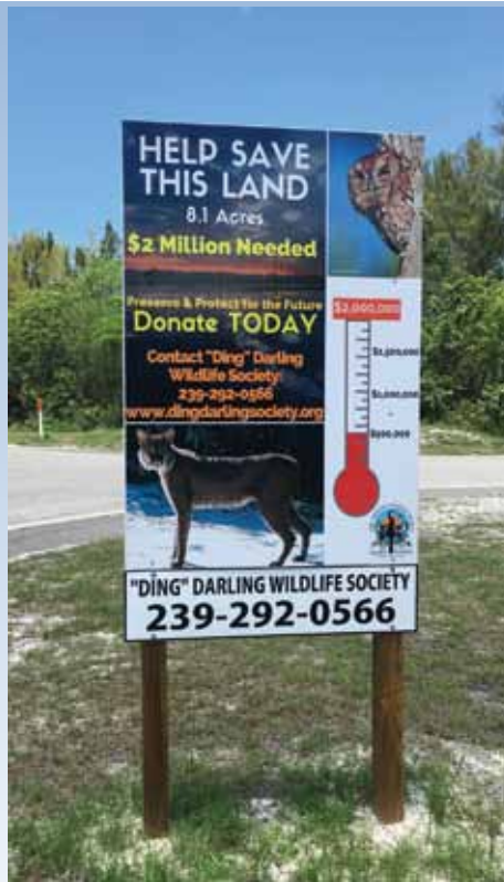
Signage on the Wulfert Road parcel the Refuge is looking to acquire