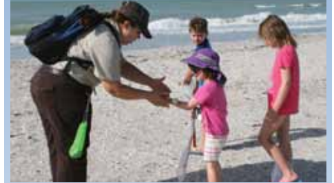
Join Refuge staff for a Family Beach Walk every Friday this summer.

Wildlife Wonders talks, weekly walks, and nature crafts highlight the Refuge's free summer programming through August 6, 2016. The programs are made possible by support from the "Ding" Darling Wildlife Society. The schedule of weekly activities follows. No pre-registration is necessary.