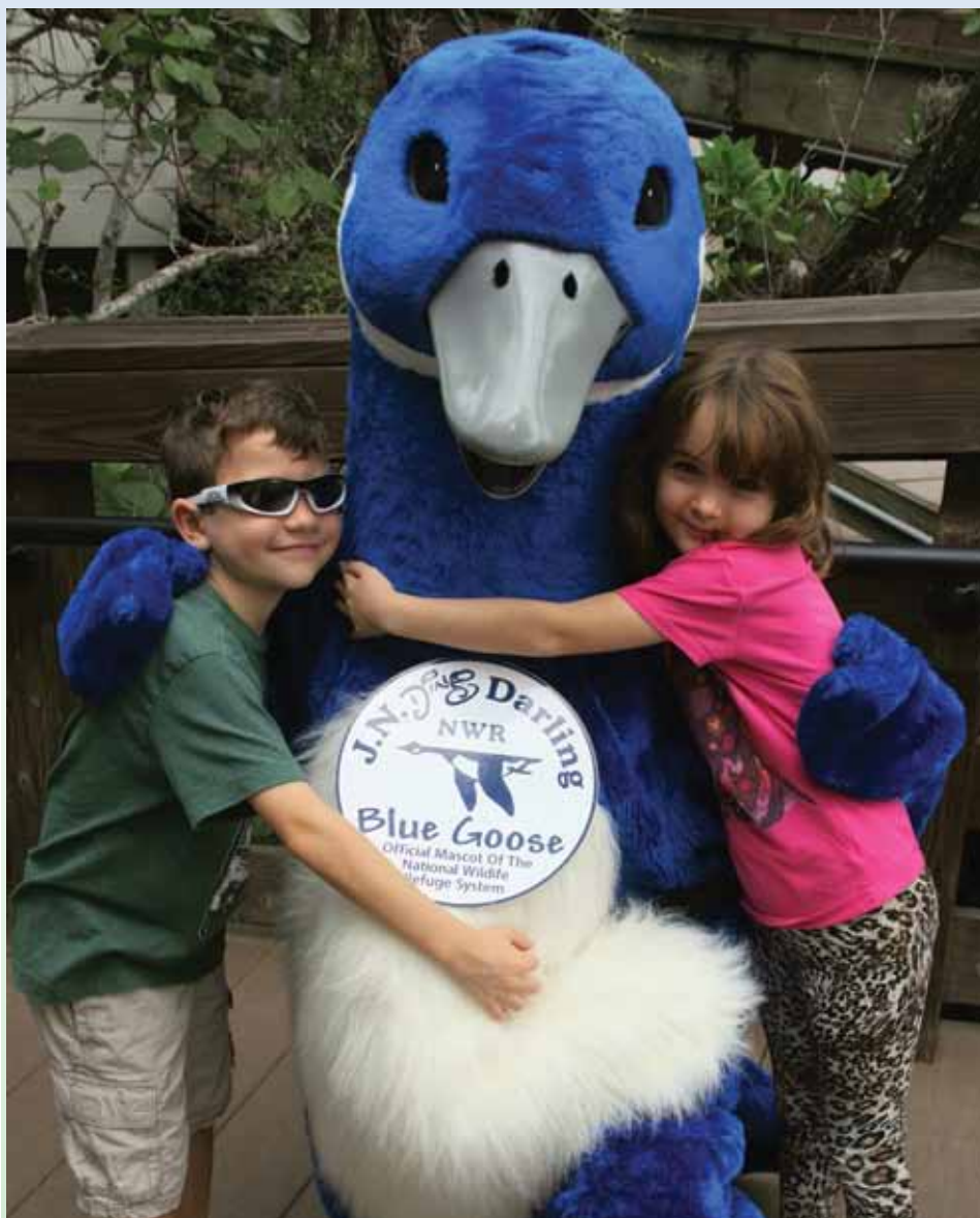
Here's one bird you can't miss at "Ding" Darling Days – the Blue Goose, mascot of the National Wildlife Refuge System.