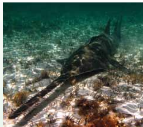
Reddish Egrets and Smalltooth Sawfish are among the crucial creatures the Wulfert acquisition will benefit.

Species that would be seriously threatened by development of the uplands, mangrove, and estuarine habitat include the Gopher Tortoise, American Oys-