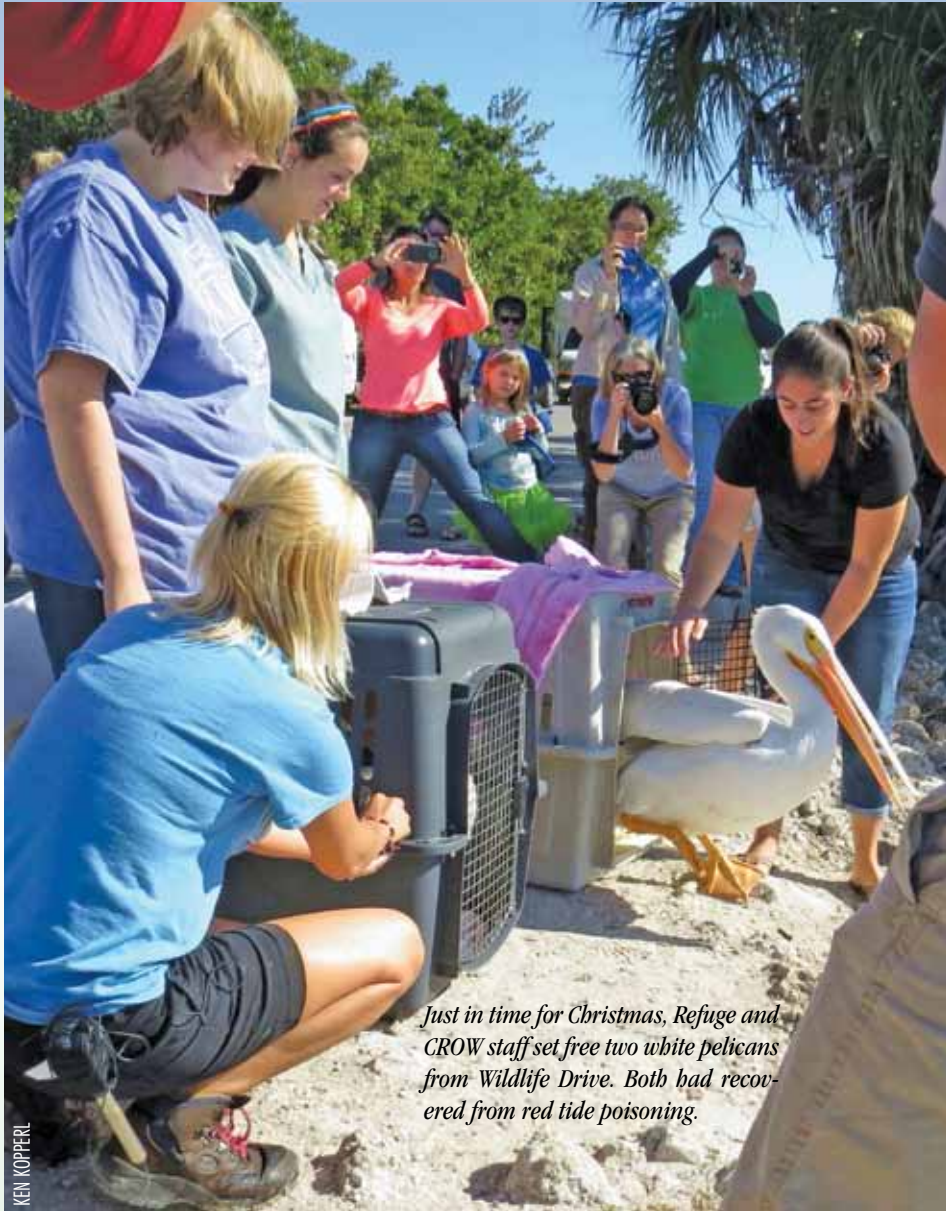
Just in time for Christmas, Refuge and CROW staff set free two white pelicans from Wildlife Drive. Both had recovered from red tide poisoning.

Winter Season 2014-2015 kicked off with Holiday Happy Hour Shopping, our annual Volunteers Holiday Luncheon, and a Refuge-DDWS presentation at the Sanibel & Captiva Islands Chamber of Commerce Holiday Business Lunch.