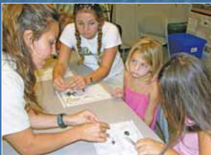
Owl pellet dissection: a popular and valuable student learning experience.

"Ding" Darling Wildlife Society, the nonprofit Friends of the Refuge organization, supports environmental education, services, and land conservation at the J.N. "Ding" Darling National Wildlife Refuge Complex. Education and conservation efforts may extend beyond the complex's borders. We partner in these efforts where possible with like-minded conservation organizations.